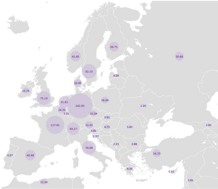
Figure 1. Air filter total market 2021. Estimation based on 2020 sales

A non-exhaustive list of major European manufactures supplying air filters includes 106 companies.